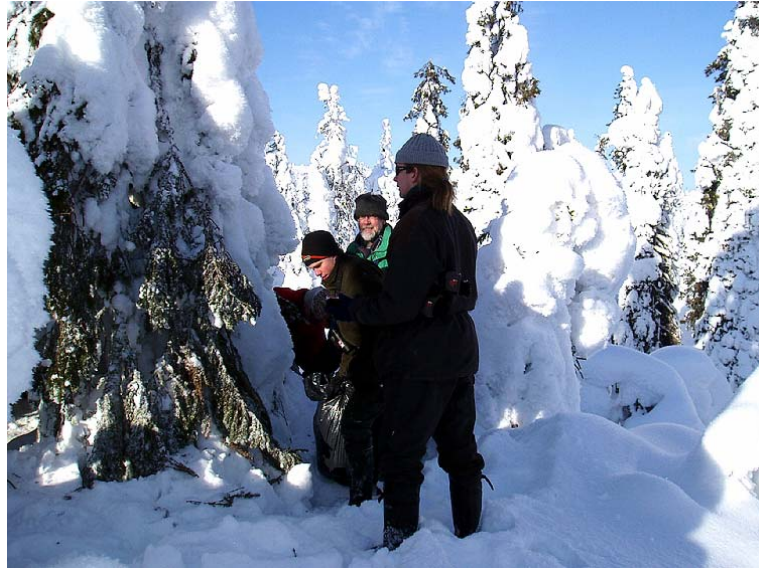
Fig. 1. Measuring of the snow load. Some parts of the tree are already measured (left side); the rest will be measure. Against a background there are the trees with the heavy snow load.